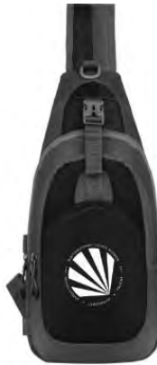
SPORT CROSSBODY SLING BACKPACK