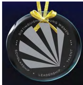
CLEAR GLASS 3’ ROUND ORNAMENT