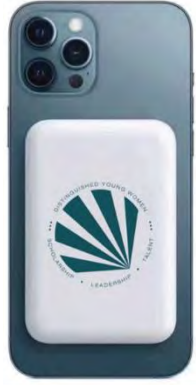
MAGNETIC PORTABLE POWER BANK

Order today for yourself or as a gift and pick up at Registration! Items will also be available for purchase at the Merchandise Table prior to the Shows in the lobby of the Theatre!