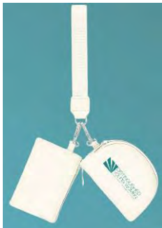
MINI WRISTLET KEYCHAIN & WALLET