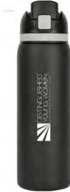
22 OZ. STAINLESS STEEL BOTTLE (OWALA DUPE!)