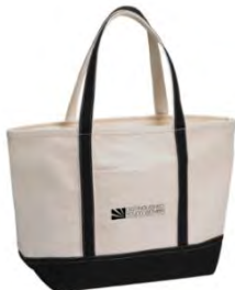
CLASSIC COTTON ZIPPERED TOTE BAG