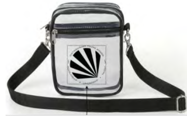
CLEAR TRANSPARENT PVC CROSSBODY STADIUM / EVENT BAG 7.5”h X 5.5”L X 1.6”W