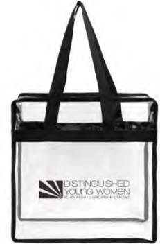
CLEAR TRANSPARENT PVC STADIUM / EVENT TOTE BAG 12”W X 12”H X 6”D